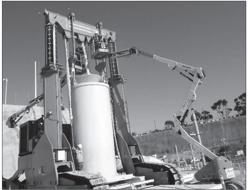
This photo of the spent fuel canister (white) was taken during a correct transfer of the canister to its vertical silo. The image shows safety secondary rigging being attached to the canister, a critical safety step that was omitted prior to the accident on August 3rd when the canister teetered on the edge of disaster.

The NRC released the results of their safety inspection on March 21st. Violation #1, failure to provide redundant drop protection, resulted in a proposed civil penalty of $116,000. Violation #2, failure to notify the NRC of the accident within 24 hours, resulted in no penalty because SCE received credit for appropriate corrective actions. SCE has the right to contest the civil penalty.