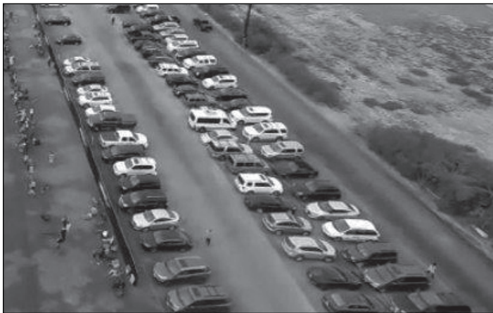
San Diego Surf Cup 3-Day Thanksgiving Youth Tournament

The tournament generated a huge amount of traffic and cars on a lot that was granted to the city in 1982 with the provision that large assemblages of people and automobiles were not allowed! Drone images used with permission..