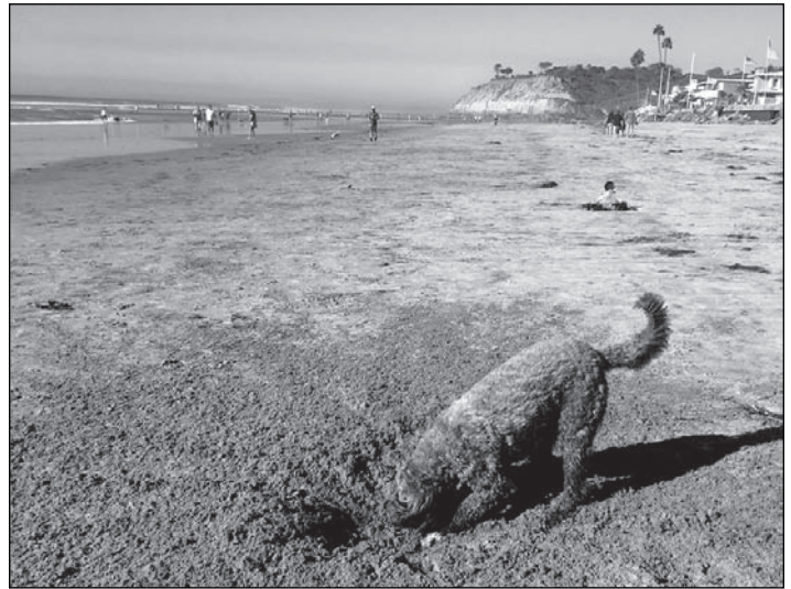
Me digging for truffles.