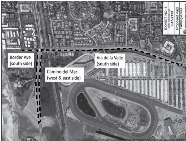
Proposed paid parking areas shown with dashed black line. Source: California Coastal Commission Addendum to Item F20a, Coastal Commission Permit Application No. 6-15-2123 (City of Del Mar), for the Commission Meeting of Friday, November 4, 2016, page 46.