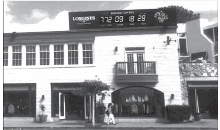
Concept for Countdown Clock to be located at top of Plaza.

The Del Mar Thoroughbred Club and the 22nd Agricultural District will host the 33rd Breeder's Cup World Championship on November 3 and 4, 2017. After spending eight seasons at the Santa Anita Race Track with the magnificent backdrop of Arcadia's San Gabriel Mountains, the Breeder's Cup will come to Del Mar next year to an equally picturesque setting on our doorstep to the Pacific Ocean.