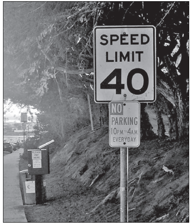
Existing paid parking, with current signage, on the west side of Camino Del Mar across from The Brigantine restaurant.