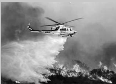
Let's make this a thing of the past, see page 6.