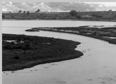
Lagoon Day is April 27, see page 9.