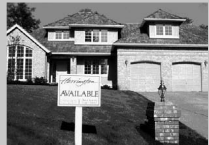
"Available", but will it be "SOLD"? See page 4.