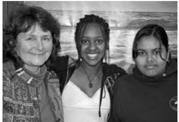
The Teen Typists